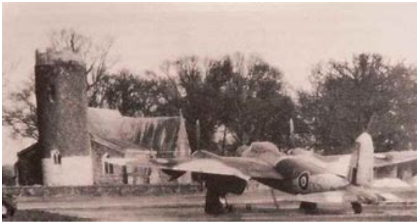
Mosquito night fighter at RAF Swannington adjacent to St Peter's Church, Haveringland.

In 2023 the church was dedicated to RAF 100 (Bomber Support) Group by the Bishop of Norwich.